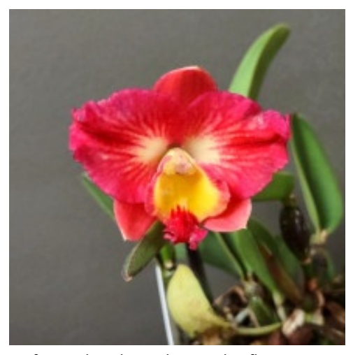
Left to right: Blc Lawless Zauberflotte 'Palmer Apricot'; Phrag. Spot On 'Purple Fuzzy'; SVO 10252 (Slc. Cosmic Delite 'Cosmic Sparks' x Slc. Mem. Trudi Marsh 'Sun Flair')