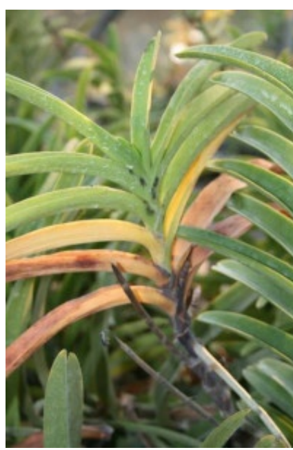
Figures 2, 3: Fusarium symptoms in banana, left, and vanda orchid, right. Plants show similar symptoms as the leaf die back is caused by the same mechanism – physical blockage of plant vessels. As the fungus progresses from the root zone up through the plant, tissues wilt progressively from bottom to top or along rhizomes from older growths into newer growth.